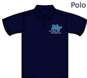
Actuarial Science Polo